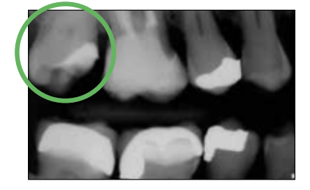
Relocate the margin with confidence!

Extra deep restorations are a significant challenge.