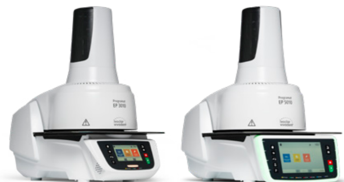
The new Programat press furnaces: EP 5010 G2 and EP 3010 G2

Proven technologies, such as the fully automatic press function (FPF), combined with new features - that is what makes the new Programat press furnace your reliable partner.